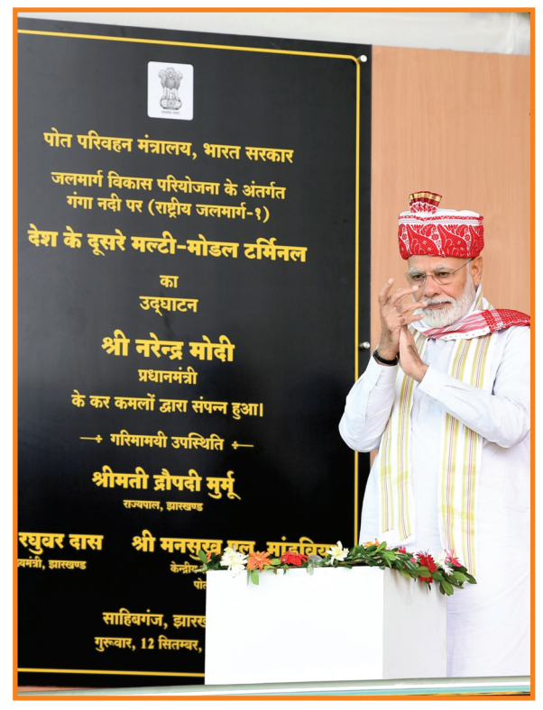
Hon'ble Prime Minister Shri Narendra Modi inaugurating Sahibganj Multi-Modal Terminal

Constructed in less than two years at a cost of Rs. 290 Cr in Phase I, this second of the three multi-modal terminals has been built on the NW-1 under the Jal Marg Vikas Project (JMVP) in record time.