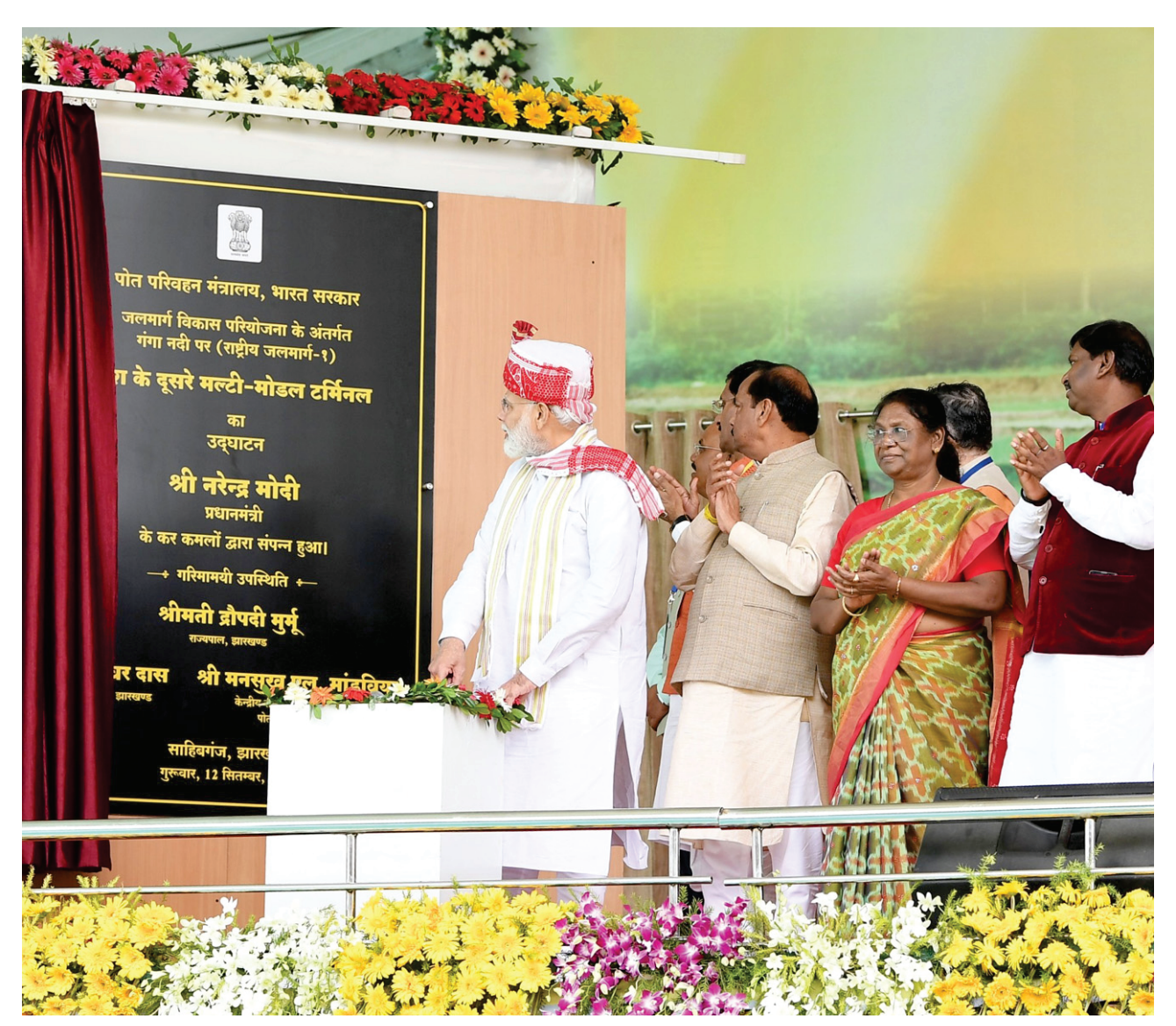
Hon'ble Prime Minister Sh. Narendra Modi with Jharkhand Governor Smt. Droupadi Murmu & Chief Minister Shri Raghubar Das at the inauguration of Sahibganj Multi-Modal Terminal

The current capacity of the terminal is expected to grow to 5.5 MMTPA after capacity expansion in Phase II by the PPP model. Around 335 acres of land has been designated for the construction of a freight village, contiguous to the terminal.