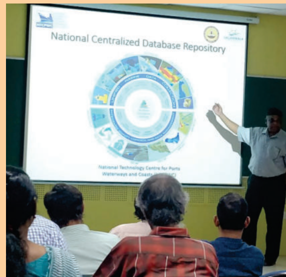
Training programme on the CIRIA manual at the joint meeting between IPA & NTCPWC