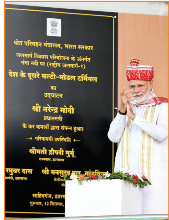
Hon'ble Prime Minister Shri Narendra Modi inaugurating Sahibganj Multi-Modal Terminal

Constructed in less than two years at a cost of Rs. 290 Cr in Phase I, this second of the three multi-modal terminals has been built on the NW-1 under the Jal Marg Vikas Project (JMVP) in record time.