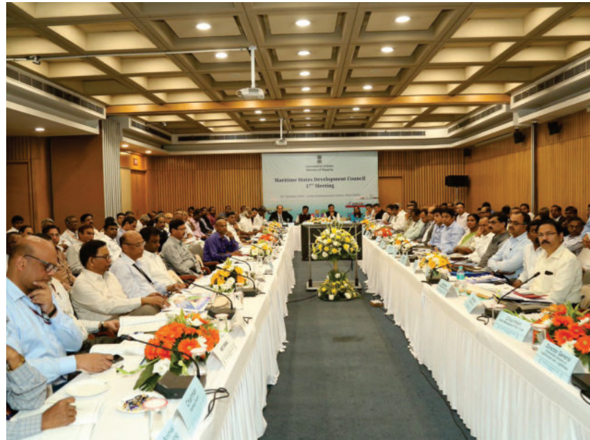
Shri Mansukh Mandaviya at the Maritime States Development Council meeting at New Delhi

The Ministry of Shipping organized the 17 th meeting of the Maritime States Development Council (MSDC) at New Delhi on October 15, 2019. During the meeting arranged to develop a National Grid for ports based on synergy between India's major and minor ports, Shri Mansukh Mandaviya, Minister of State for Shipping (I/c) and Chemicals & Fertilizers called for revival of the ports that are not yet operational. Shri Mandaviya said, "There are 204 minor ports in the country, of which only 44 are currently functional. All these ports have been centres of maritime activity in the past, and if revived, they can once again become important centres of sea trade. The Government is looking at developing synergy between the major and minor ports so that together they can bring port-led development in the country."