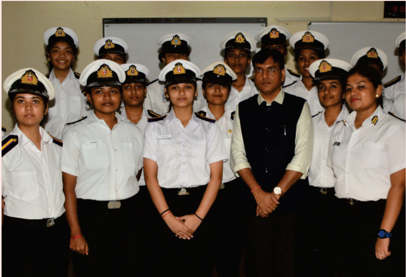
Shri Mansukh Mandaviya with women seafarers

Addressing the country on the World Maritime Day 2019, Shri Mansukh Mandaviya, Minister of State for Shipping (I/c) and Chemicals & Fertilizers spoke of the respect and empowerment the Indian culture had accorded to women. Extending greetings to all women seafarers, he said they were showing equal enthusiasm and bravery in serving the nation.