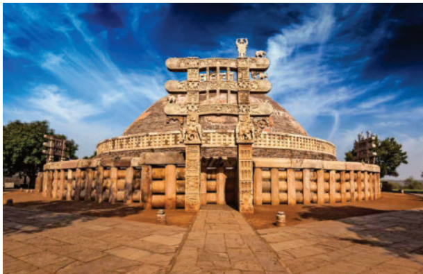
Sanchi Stupa built during the Mauryan age

Sea trade began during the latter half of the Mauryan period. In addition to focusing on exports and imports, the Mauryan rulers engaged in the shipbuilding business and hired them out to merchants for commercial purposes.