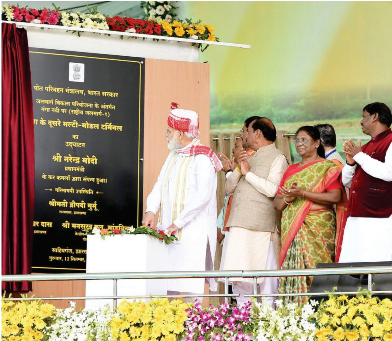
Hon'ble Prime Minister Sh. Narendra Modi with Jharkhand Governor Smt. Droupadi Murmu & Chief Minister Shri Raghubar Das at the inauguration of Sahibganj Multi-Modal Terminal

The current capacity of the terminal is expected to grow to 5.5 MMTPA after capacity expansion in Phase II by the PPP model. Around 335 acres of land has been designated for the construction of a freight village, contiguous to the terminal.