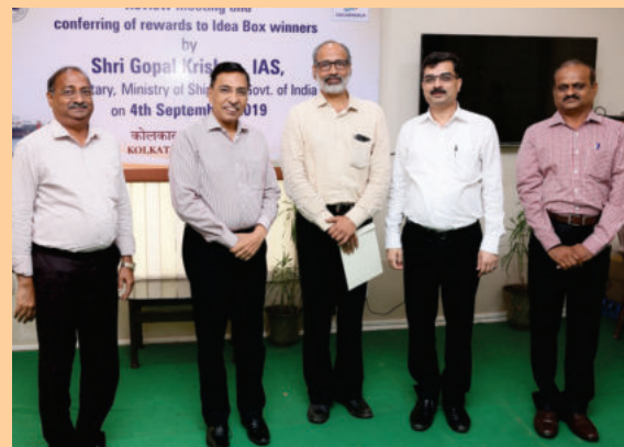
Ideabox Challenge winners awarded at Kolkata Port Trust

With a view to seek innovative ideas and out-of-the-box solutions to improve existing processes, increase revenue, boost tourism and implement a green energy model, KoPT launched the Ideabox Challenge. Over 200 ideas, covering various aspects of port operations were received of which the top three winners were awarded a cash prize of Rs. 50,000 each while six consolation prizes were also given out to encourage those who had participated in the challenge.