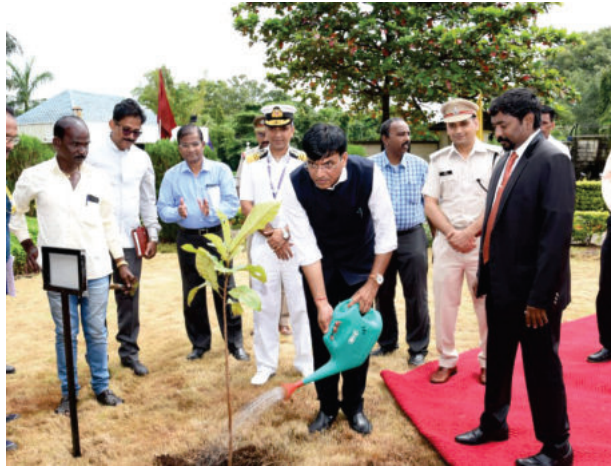
Shri Mansukh Mandaviya plants a sapling at the Mormugao Port