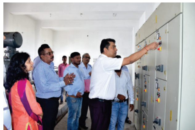
Paradip Port Chairman at the port's sewage treatment facility

In sync with Indians' determination to keep their environment clean, the Paradip Port has conducted trials on two sewage treatment plants, each with a capacity of 4.5 million litres daily. These two plants are state-of-the-art facilities and have been constructed at an estimated cost of nearly Rs. 22 crores.