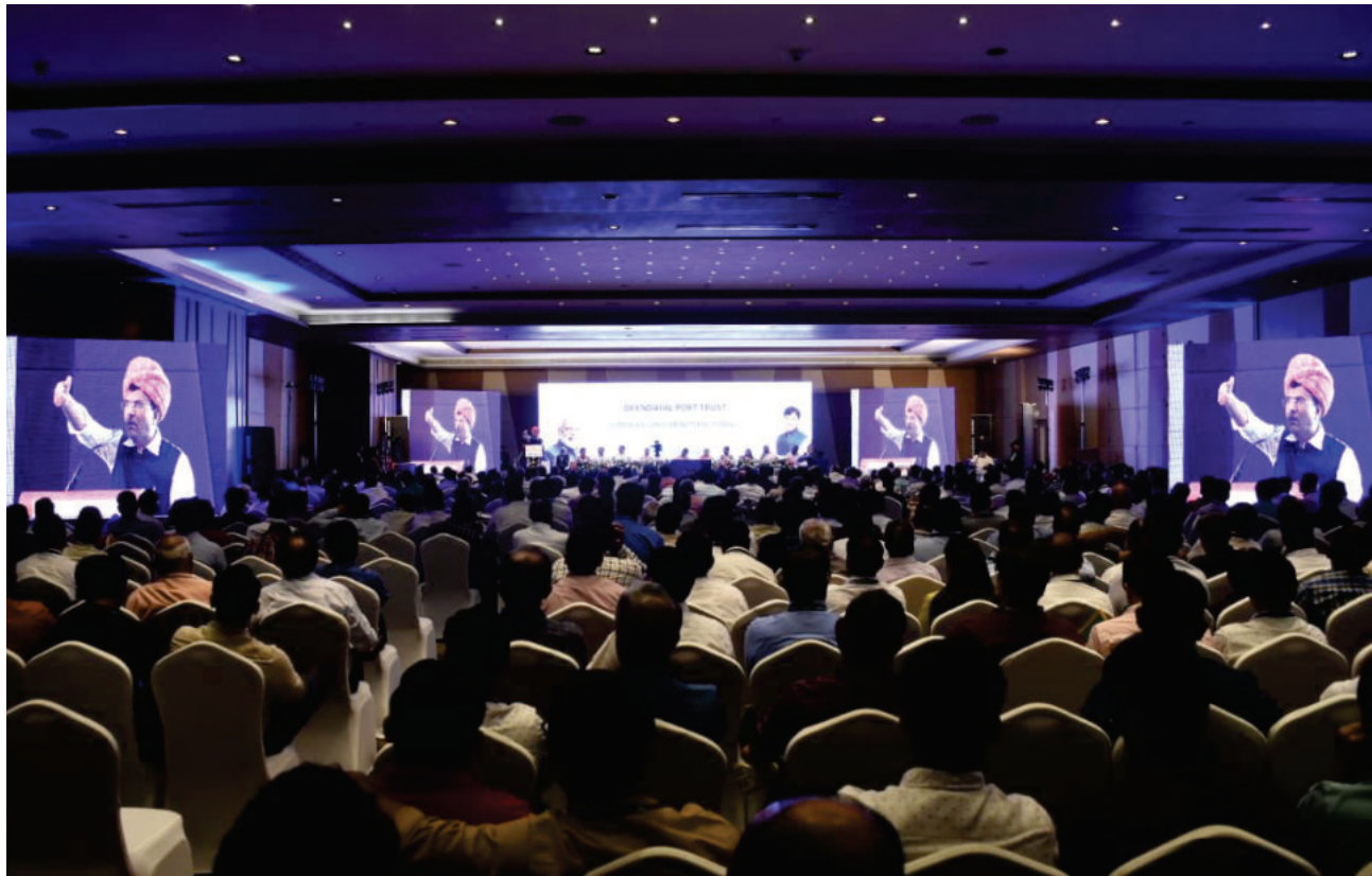
Shri Mansukh Mandaviya addressing Deendayal Port officials at SIPC, Gandhidham