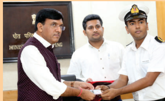
Shri Mansukh Mandaviya hands over BSID to seafarers

In another event that marked the gradual progress of the Indian shipping sector, India became the first country in the world to issue a Biometric Seafarer Identity Document (BSID) to its seafarers. At the launch event held on August 28, 2019, at New Delhi, Shri Mansukh Mandaviya, Minister of State for Shipping (I/c) and Chemicals & Fertilizers handed over the new BSID cards to five Indian seafarers.