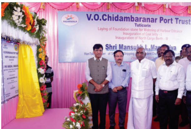
Shri Mansukh Mandaviya with VO Chidambaranar Port officials