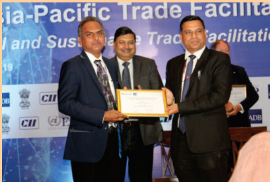
Tuticorin CFS Association recognised for installation of CoDEX at VOC Port

The Tuticorin CFS Association was conferred the “International Trade Facilitation Innovation Award” for the successful installation of Container Digital Exchange system (CoDEX) at the VO Chidambaranar Port at a function organised by Asia Pacific Trade Facilitation Forum (APTFF) on September 18, 2019 at New Delhi. The event was organised by the Asian Development Bank (ADB), United Nations Economic and Social Commission for Asia and the Pacific (ESCAP) in partnership with the United Nations Conference on Trade and Development (UNCTAD), World Customs Organization (WCO) and World Trade Organization (WTO).