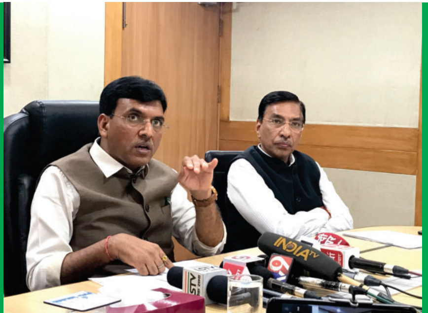
Shri Mansukh Mandaviya addressing the media about the benefits of the SOP between India & Bangladesh

Shri Mansukh Mandaviya, Minister of State for Shipping (I/c) and Chemicals & Fertilizers recalled how the Prime Minister Shri Narendra Modi's foreign policy initiative concerning the use of Chattogram and Mongla Ports in Bangladesh for cargo movement to and from India will ensure lower costs of shipments to and from the country's Northeastern states in addition to reducing time and distance for transport of goods.