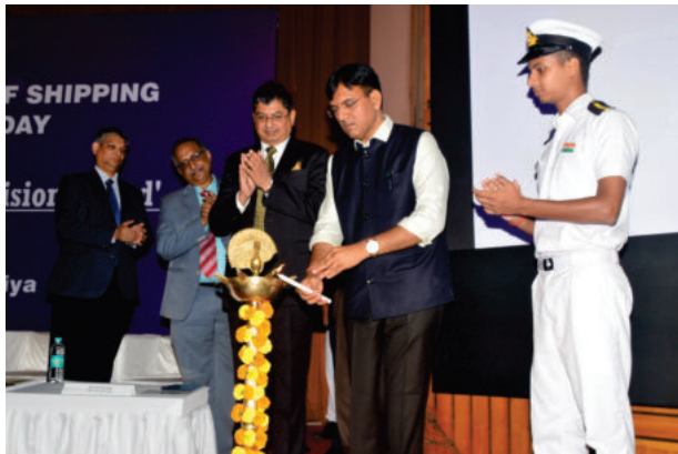
Shri Mansukh Mandaviya at the 70 th Foundation Day of the Directorate General of Shipping

The Directorate General of Shipping celebrated its 70 th Foundation Day on September 03, 2019 amidst much celebration at an event in Mumbai. At the event organized to acknowledge its contributions to the shipping sector, Shri Mansukh Mandaviya, Minister of State for Shipping (I/c) and Chemicals & Fertilizers along with other officials discussed ways to encourage safe, secure and pollution-free shipping.