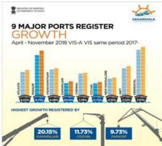
Cargo traffic handled at Major Ports:

For the period from April- November 2018, Nine Ports Kolkata (incl. Haldia), Paradip, Visakhapatnam, Kamarajar, Chennai, Cochin, New Mangalore, JNPT and Deendayal have registered positive growth in traffic.